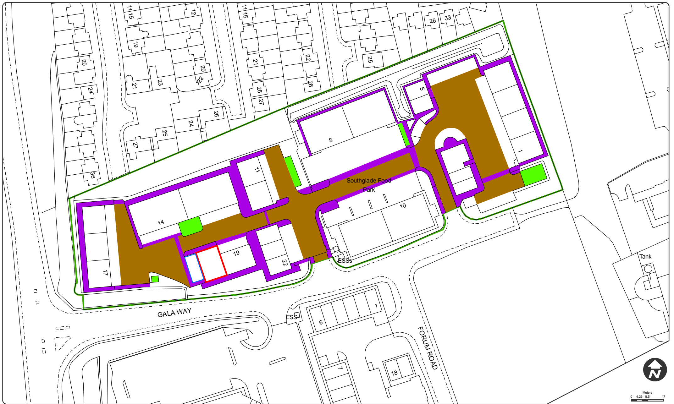
Southglade Food Park Unit 18 Plan

© Crown copyright and database right 2015. Ordnance Survey Licence number 100019317 M:\Strategic Property\Estates\Property Records\Scanned Tracings\Southglade Food Park Phase 2