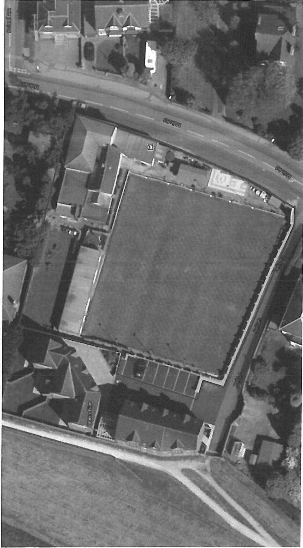
SECTION 6 - Satellite View of Area to be Listed, outlined in Red