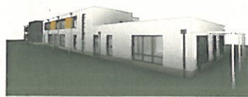
④ View from West corner