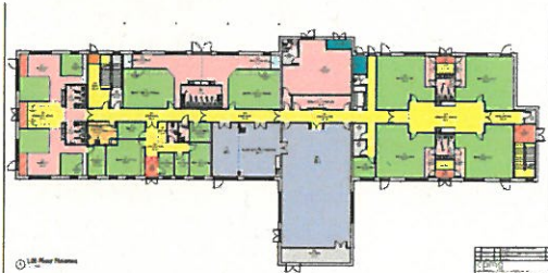
① Lift Plant Room